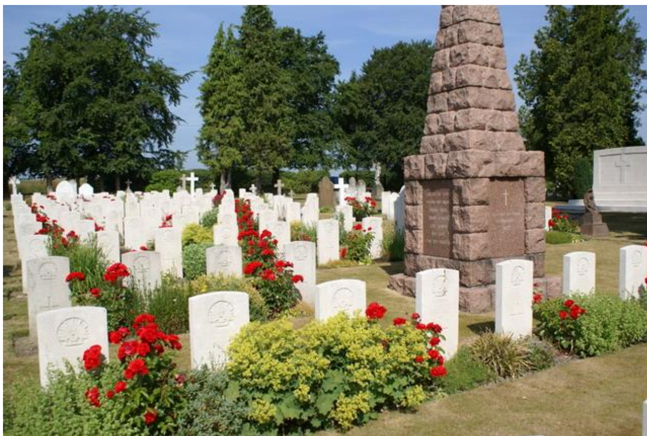
Durrington Cemetery, Wiltshire